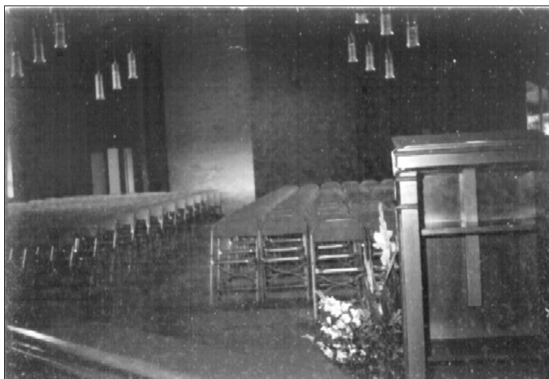
New sanctuary looking from the front to the back. Note the brick wall at the back and the metal chairs.